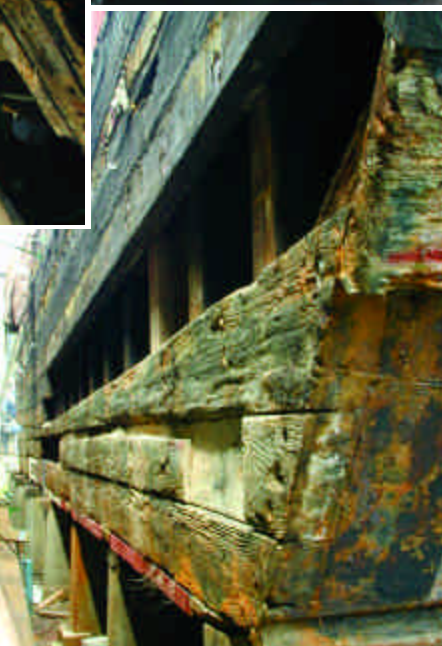
Worms, time and saltwater took a toll on the 87 year old barge. With restoration nearly complete, it has found new life as a waterfront museum, classroom, art exhibition center and reception hall.

T his is a story of grand old wooden boats and the worms that eat them.