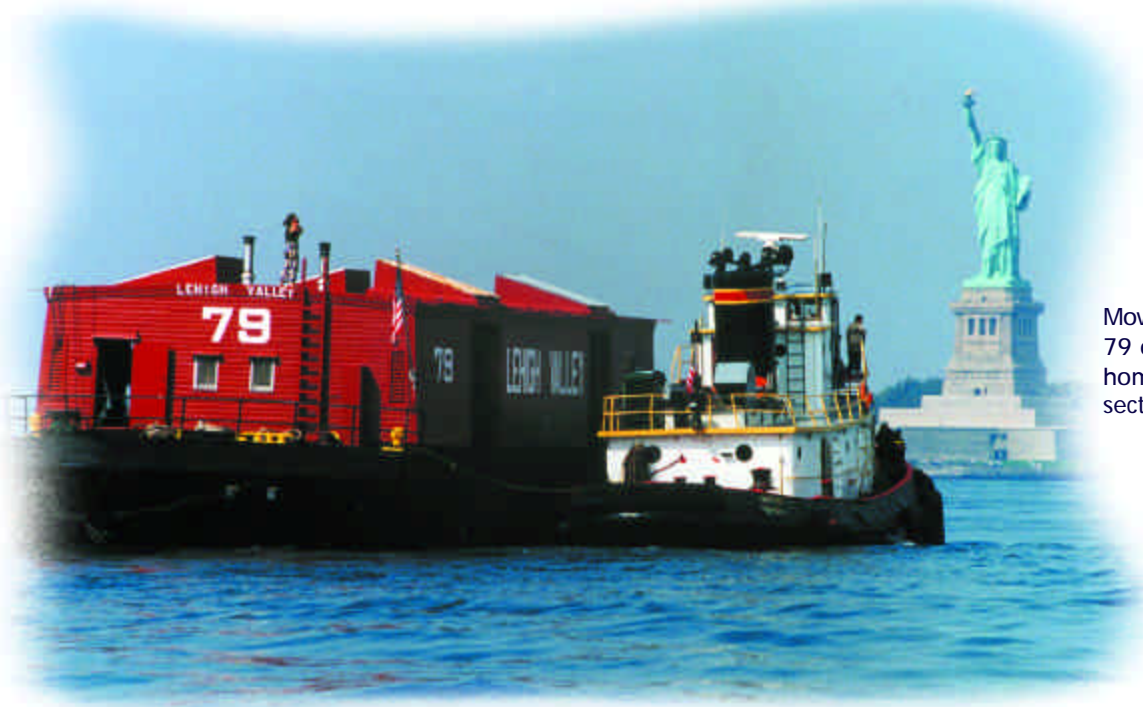
Moving day. Barge LV. 79 on its way to a new home in the Redhook, section of Brooklyn.

recognition by the United Nations for opening up waterfronts to the general public.